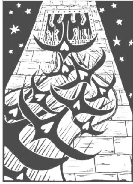
Their violence has a house where my brothers and sisters sharpen their dreams on the bars of the cage

The 7 political prisoners were granted Provisional Measures from the Inter-American Court of Human Rights to recognize the risks they face and to prevent further human rights violations. Since these Provisional Measures were not respected by the penitentiary director or the general administration of INPEC, the 7 prisoners went on strike on January 8th. By January 25th, already exhausted and in a fragile health condition, they radicalized the strike by stopping their oral serum intake and declared that they would accept food if they were moved to reception area cells (used for prisoners arriving or leaving the facilities), awaiting their transfer. They gave an ultimatum of 15 days, seeing that INPEC was only planning on meeting 10 days later to discuss strategies to end the strike.